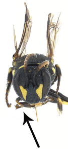
Figure 6. Masked-faced bee adult. Arrow indicates the bright yellow markings common to this group.

Description: There are approximately five species of masked-faced bees found in the Puget Sound Region. Bees are generally quite small (between 5 and 7 mm in length), and body color is mainly black, with bright yellow and white markings. This group will often have “diamond-shaped” yellow markings on their face (Figure 6), and they collect pollen internally (i.e., not in hairs on the abdomen or legs). Masked-faced bees produce a cellophane-like material to seal brood cells.