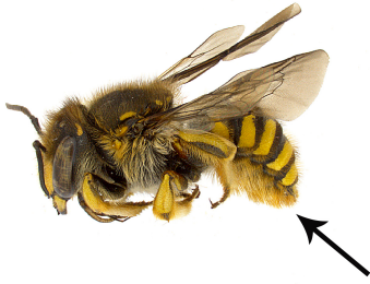
Figure 4. Wool carder bee adult. This individual has the bold yellow and black striping pattern common to this group. Arrow indicates scopal hairs located on the abdomen.

Description: There are approximately three species of wool carder bees in the Puget Sound Region. Coloration of individuals in this group is often a bold yellow and black striping pattern on the abdomen (Figure 4). Wool carder bees will also have pollen-carrying scopal hairs on the bottom side of the abdomen. Bees within this group collect trichomes (i.e., plant hairs) from plants in the family Lamiaceae to seal their brood cells.