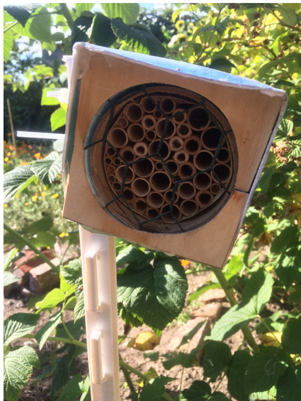
Figure 8. Example of a rolled cardboard tube bundle used in our now complete citizen science project: The Pollinator Post Project.

Citizen science, the involvement of the public in research, can be used to effectively monitor cavity-nesting bees, aiding in the understanding and conservation of these important pollinators (Gardiner et al. 2012). From 2015 to 2017, we worked with farmers and gardeners to collect data on the diversity of cavity-nesting bees in home gardens of the Puget Sound Region. The goal of this project was to help gardeners identify key nesting resources needed to conserve cavity-nesting bees, and improve pollination to nearby crops. Our preliminary results indicate that citizen scientists in the Puget Sound Region can help researchers identify species of critical restoration concern, and better understand long term trends in cavity-nesting bee biodiversity. To see the results of this project, visit our website: www.nwpollinators.org .