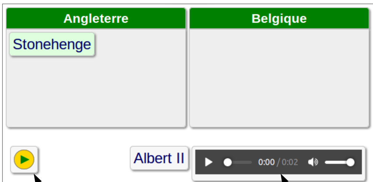
HTML5 mini audio button

There are two kinds of HTML5 audio player :