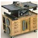
Table Saw Cabinet Plan

Our favorite shop tips for clean and safe rip cuts every time.