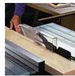
Table Saw Tuneup

Easily rolls away for storage. Includes sawdust collection.