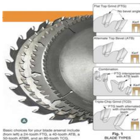
Basic choices for your blade arsenal include (from left) a 24-tooth FTG, a 40-tooth ATB, a 50-tooth ATBR, and an 80-tooth TCG.

There are four basic blade types, determined by the shape, or grind, of their teeth. They are flat top grind (FTG), alternate top bevel (ATB), combination (ATBR), and triple-chip grind (TCG) [Figure 1 and Photo A].