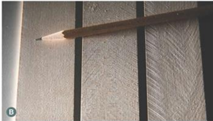
The surface at left, cut with a premium-quality 40-tooth ATB blade, is glue-ready and needs little cleanup to serve as a finished surface. The center piece—sawn with a good quality 24-tooth FTG blade is a bit rough, but good enough to glue up as is. The cut at right, made with a cheaper 24-tooth FTG blade, needs a pass over the jointer first.

When rough-ripping to break down a board into slightly oversized project parts, a 24 tooth FTG blade is a good bet because it cuts through even thick hardwoods quickly. It doesn't cut very smoothly, but because the pieces will be sawn to final dimensions later, it doesn't matter.