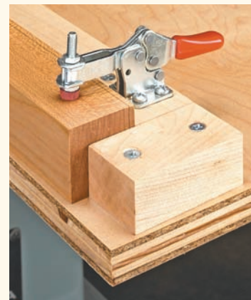
◀ Hold-Down. Toggle clamps hold the workpiece securely, allowing you to keep your fingers away from the blade.