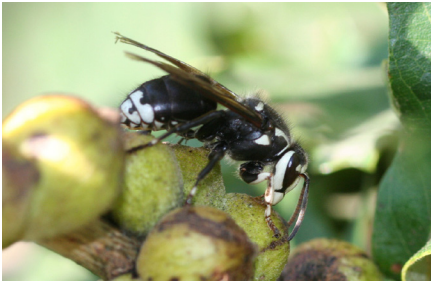
Figure 2: Baldfaced hornet.