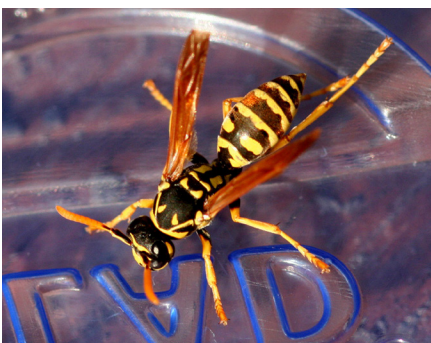
Figure 6: European paper wasp.

Colonies are readily defended and yellowjackets will sting when the nest area is disturbed.