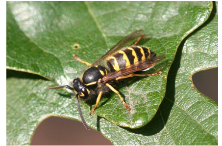
Figure 3: Western yellowjacket.

The western yellowjacket ( V. pensylvanica ) is, by far, the most important stinging insect in Colorado. Late in the season, when colonies may include up to 200 individuals, they become serious nuisance pests around outdoor sources of food or garbage. The western yellowjacket is estimated to cause at least 90 percent of the “bee stings” in the state.