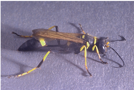
Figure 8: Mud dauber.

Another important group of wasps are the parasitic wasps . These wasps lay their eggs in other insects and the developing wasp larva slowly consumes and ultimately kills the host insects. Parasitic wasps are non-aggressive, only sting when handled, and are considered beneficial for their role in controlling a wide variety of pest insects. They are discussed further in fact sheet 5.550, Beneficial Insects and other Arthropods .