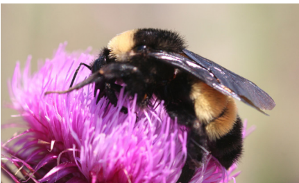
Figure 11: Bumble bee queen.

A strain of the honeybee, known as the Africanized honey bee , has received considerable attention due to its tendency to readily sting when nests are disturbed. This is a tropical strain of bee that is poorly adapted to areas of cool weather. It does occur in parts of the southwestern United States but is unlikely to ever establish in Colorado.