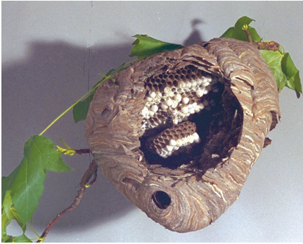
Figure 4: Baldfaced hornet nest cutaway to expose paper comb.