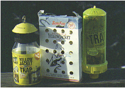
Figure 7: Yellowjacket traps.

Commonly sold wasp traps only are effective for yellowjackets. They are not attractive for paper wasps or hornets and will not assist in control of these types of wasps.