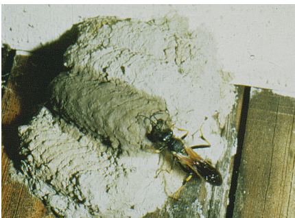
Figure 9: Mud dauber building nest.