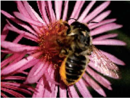
Figure 13: Leafcutter bee collecting pollen.