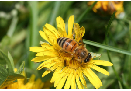
Figure 10: The honey bee is an important and beneficial insect due to its production of honey and other products, as well as pollination of plants.

A strain of the honeybee, known as the Africanized honey bee , has received considerable attention due to its tendency to readily sting when nests are disturbed. This is a tropical strain of bee that is poorly adapted to areas of cool weather. It does occur in parts of the southwestern United States but is unlikely to ever establish in Colorado.