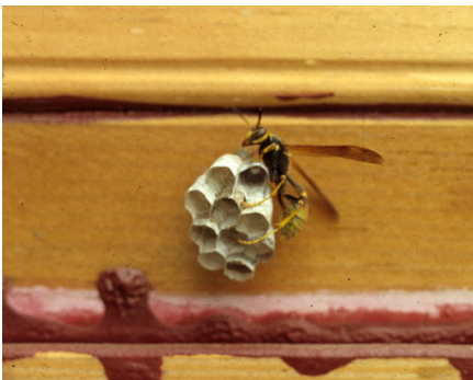
Figure 5: The western paper wasp, a native species of paper wasp.