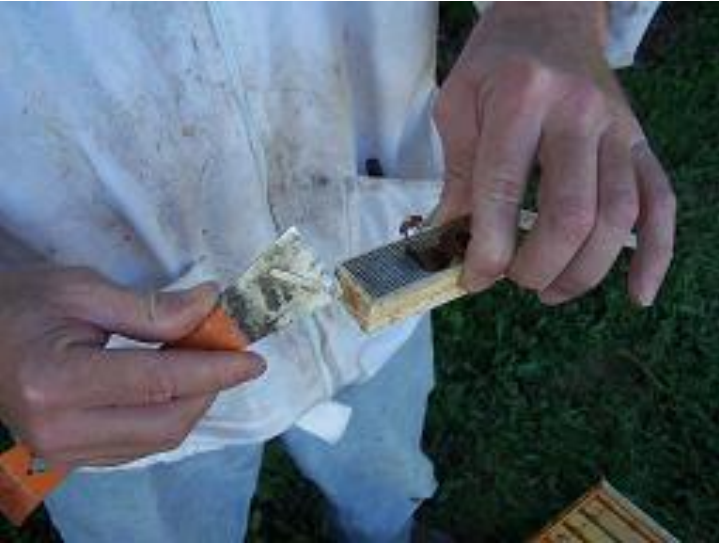
Removing the cork covering the candy plug

5) Check the queen to make sure she is alive. Remove the cork or any cover blocking the candy end of the queen cage and poke a hole through the candy with a nail or a matchstick, being careful not to impale the queen. The hole should be large enough so the bees can release the queen within 24- 48 hours, but not so large that the queen can get out immediately.