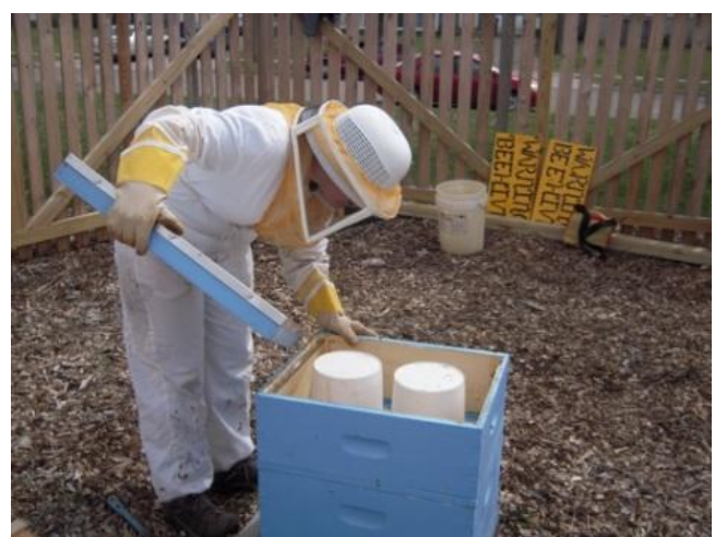
Adding pails of sugar syrup, upside down, so the bees will have something to eat right away.

11) Add an empty hive body over the inner cover and cover the hive with the outer cover.