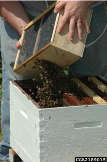
The bees are shaken into the hive

7) Remove the lid from the hole in the top of the package and hold the package box, topside down over the hive and shake the bees vigorously into the empty space left by removing the four frames. Continue shaking until it is empty.