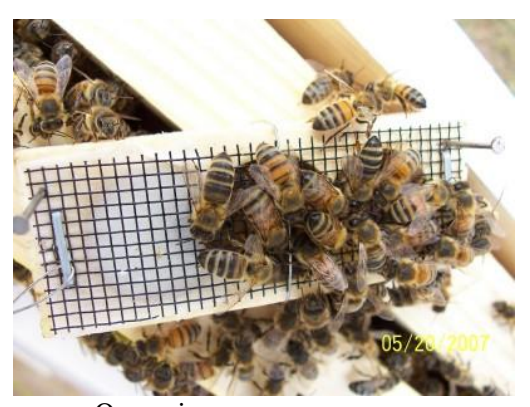
Queen in a cage

The package of bees usually contains bees shaken from two or more colonies, and the queen supplied with the package is bred from selected colonies to be sent in the package. The queen is kept in a separate small wooden or plastic cage with one screened side and candy release plug. The caged queen in the package is well protected and fed through the screen during transportation, and usually accepted by the bees within 12 - 24 hours. The bees free the queen to leave the cage by eating the sugar candy blocking the exit hole of the cage.