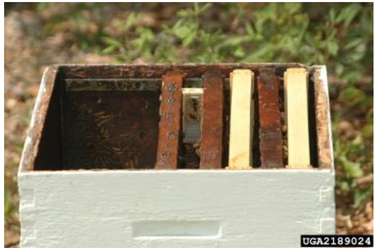
Queen cage between two frames

7) Remove the lid from the hole in the top of the package and hold the package box, topside down over the hive and shake the bees vigorously into the empty space left by removing the four frames. Continue shaking until it is empty.