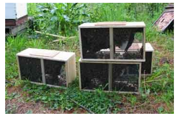
Packages of bees ready for hiving "Photo courtesy of Betterbee, Inc.™ <u>www.betterbee.com</u> all rights reserved"

Khalil Hamdan, Apeldoorn, The Netherlands